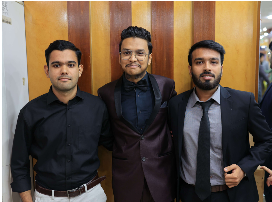
Software Nedians from team returntoPwn (team Picture)

The triumph of team returntoPwn in the BlackHat MEA CTF'23 competition highlights their exceptional skills and their ability to thrive in high-pressure situations. Their victory serves as an inspiration to aspiring cybersecurity professionals and demonstrates the incredible potential within our community.